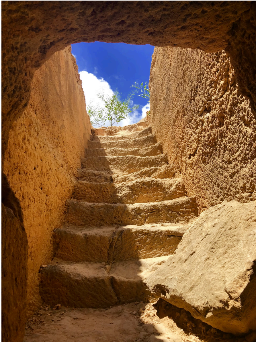
Tombs of the Kings, Paphos, Cyprus