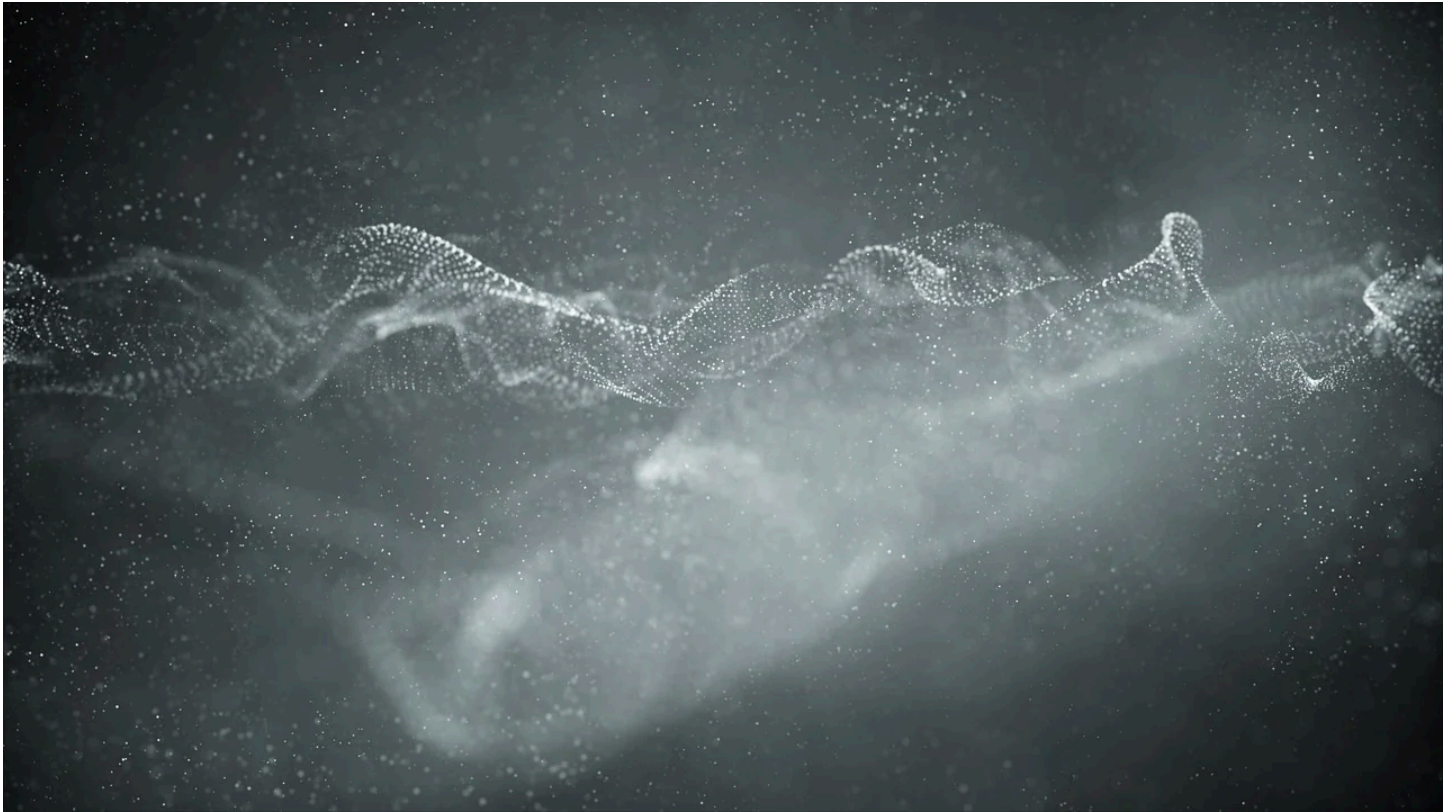
Illustration by Tomislav Jakupec