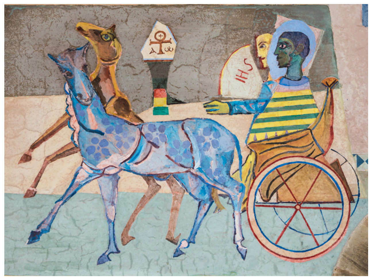
Philip and the Ethiopian Eunuch Fresco by Herbert Boeckl, 1894–1966