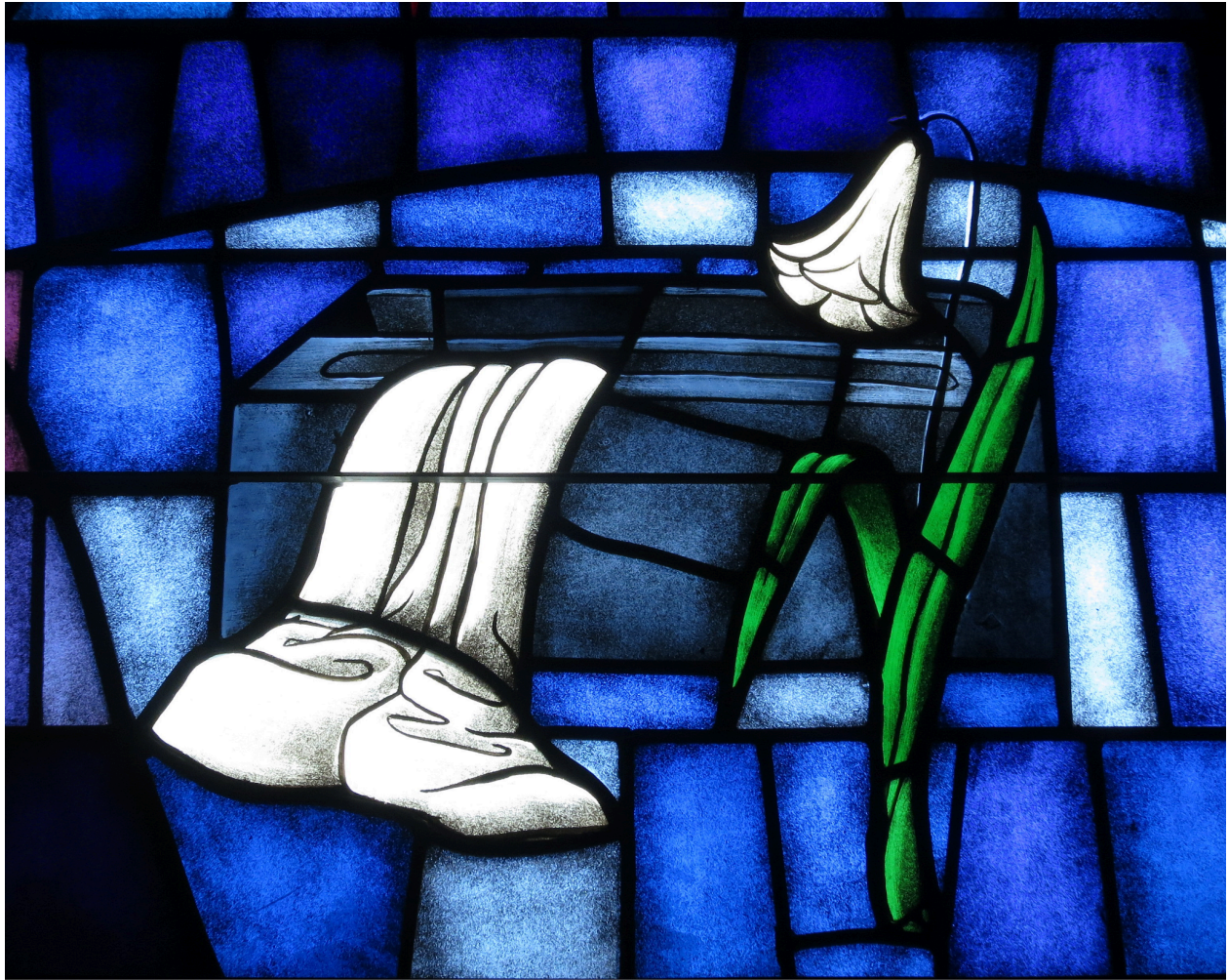
The Empty Tomb Stained glass, Saint James the Greater Catholic Church, Concord, NC