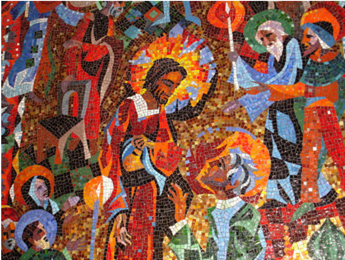
“Christ Shows Himself to Thomas”